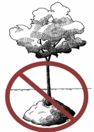
Improper mulch technique