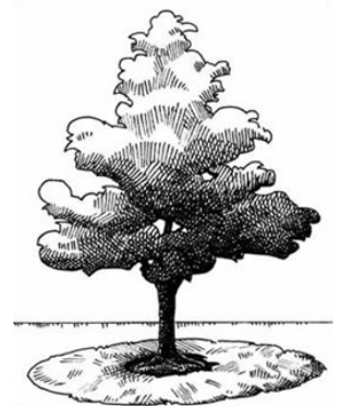
Correct mulch technique. Wide ring, away from trunk.