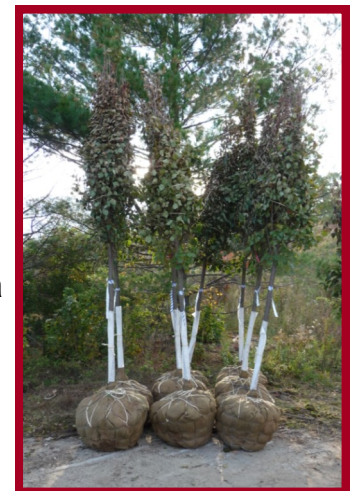
B&B trees with trunk wrap