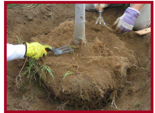
Removing excess soil from the top of the root ball using a hand cultivator