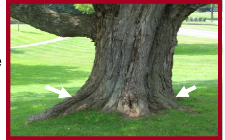
Trunk flare on mature tree