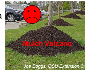
This poor practice is commonly seen in the landscape and is harmful to trees.

Fertilizer should only be used if a soil test indicates a deficiency. New trees typically do not require fertilization. For information on testing your soil, contact the UMass Soil and Plant Nutrient Testing Lab, https://soiltest.umass.edu/ or 413-545-2311. Improper use of fertilizer can damage your tree and the environment.