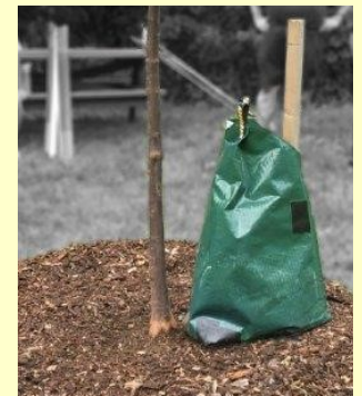
A watering bag