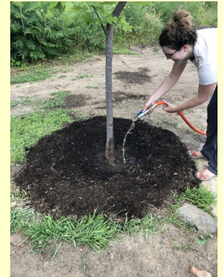
Slow watering with a hose

If winter damage to the trunk by rodents is a concern, install a trunk guard made of plastic tubing, hardware cloth, or wire fencing. Allow 1-4 inches of space around the trunk and ensure it is tall enough to protect in snow. Remove in the spring.